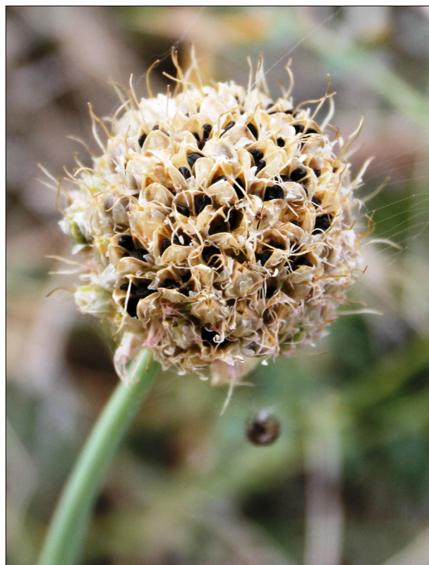
Fig. 1b. Mature umbel of Allium carolinianum .