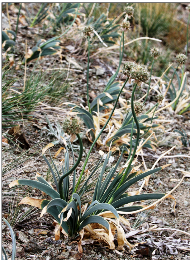
Fig 1a. Allium carolinianum in Baitag Bogdo, West Mongolia.