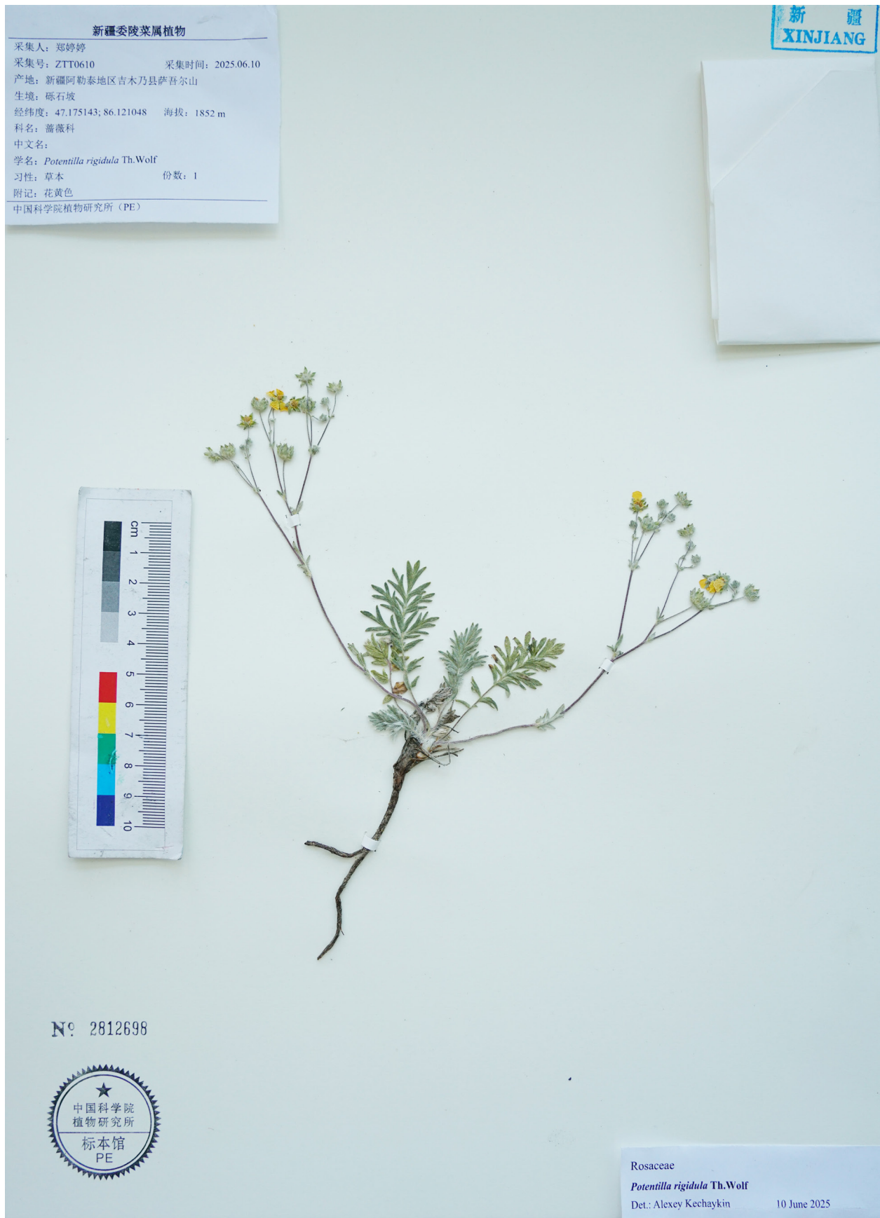
Fig. 2. Herbarium specimen of Potentilla rigidula (PE).