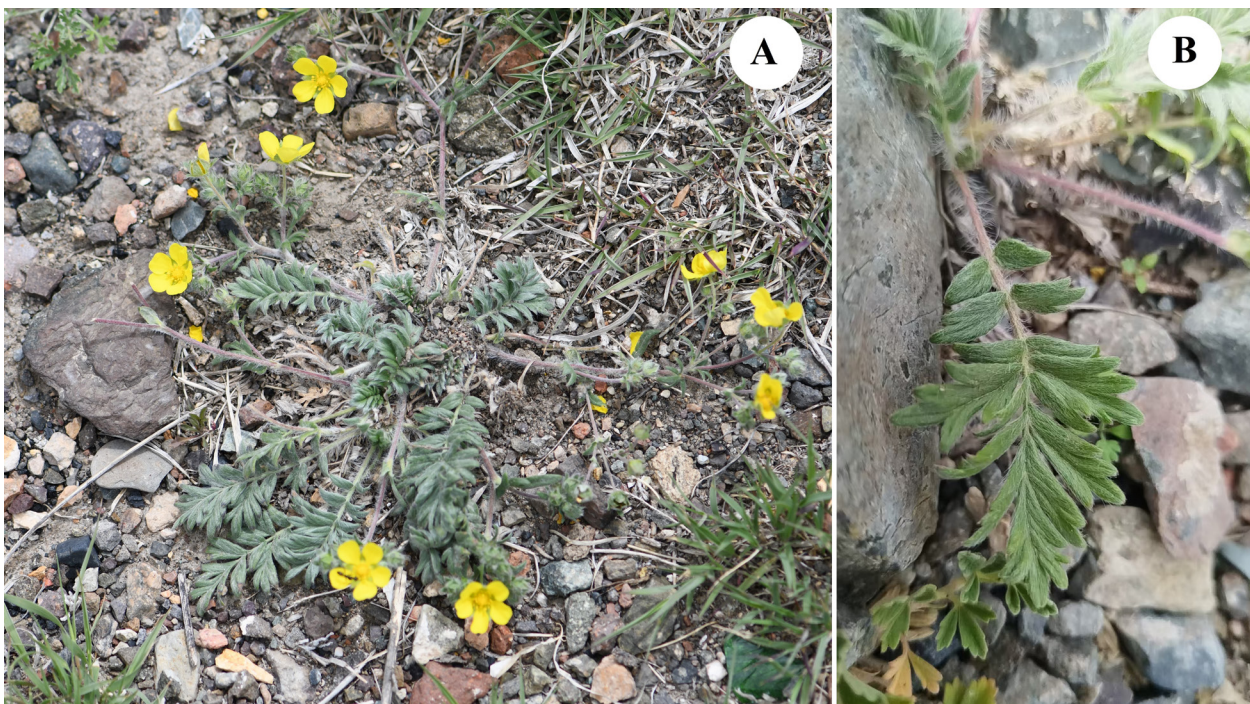
Fig. 1. Potentilla rigidula on the eastern spurs of the Saur Ridge: A – plant appearance (photo by Liguang Sun); B – separate leaf blade (photo by Tingting Zheng).

Potentilla rigidula Th. Wolf: “Xinjiang, Sayur Mountain, Jeminay County, Altay Prefecture, gravelly slope, 1852 m. 47.175143°N, 86.121048°E. ZTT0610. 10 VI 2025. Tingting Zheng” (PE) (Figs. 1, 2). – Described from a single specimen collected in Altai, it is a subendemic of the AMC. Outside the study area, several occurrences of P. rigidula have been recorded on the spurs of the Khangai Mountains and in the western part of the Gobi Altai (Fig. 3; see also the supplementary material in the appendix at the journal’s website). Numerous finds are concentrated in the Chuya steppe of the Republic of Altai and in northwestern Mongolia (Kechaykin, 2013; Kechaykin et al., 2022). It inhabits mainly intermontane basins on rocky steppes and semi-deserts, gravel beds. In Mongolia, it has been repeatedly found on alluvial fans. Apparently, P. rigidula replaces its close relative P. soongorica Bunge to the north and east of the Dzungarian Gobi, from which it differs in its pubescence, as well as