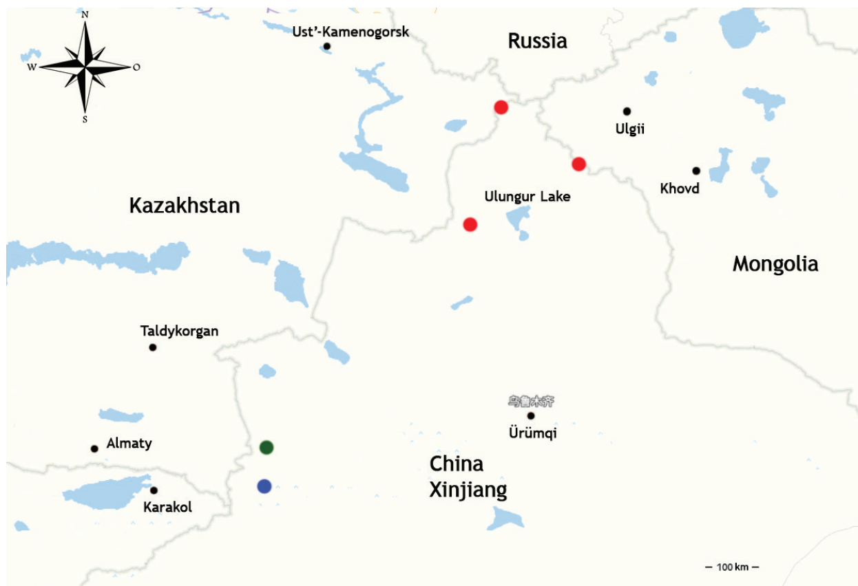
Fig. 1. The new floristic findings of Pedicularis L. in Xinjiang, China.