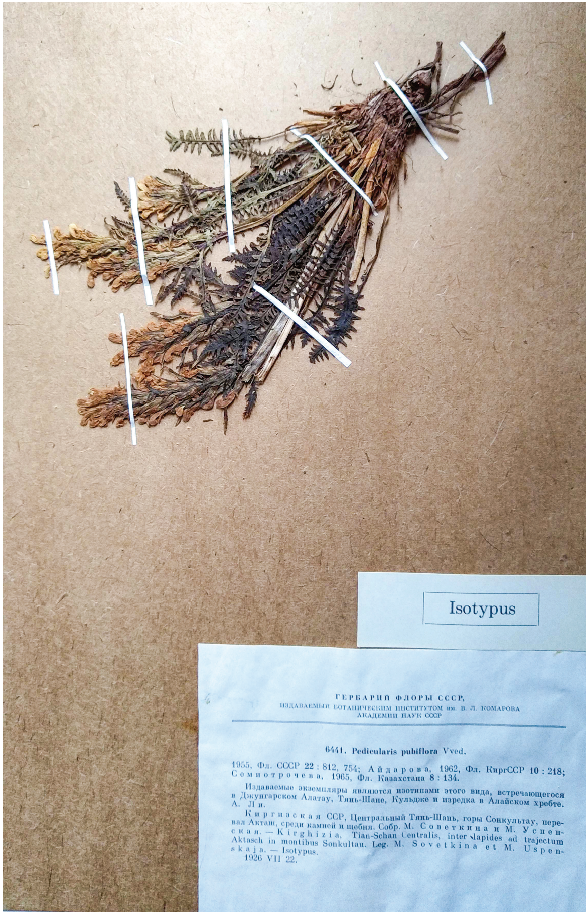
Fig. 2. Isotype of Pedicularis pubiflora Vved. from National Academy of Science, Kyrgyzstan (FRU).