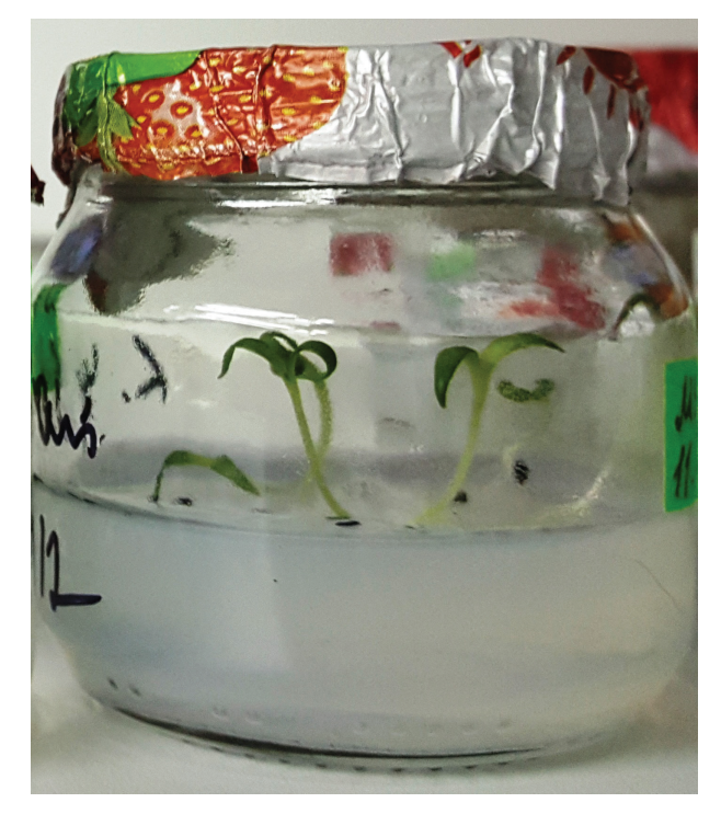
Fig. 1. Gypsophila uralensis implementation in in vitro culture on the harmonious MS medium (14th cultivation's day).

age, the duration of one passage was 47 \pm 6 days. The volume of callus tissue increased more than 2.5 times during this period. The frequency of callus formation was high and varied from 82 to 94 %. The average number of fragments per callus was 6. 2 \pm 0.4 on MS and 4.5 \pm 0.4 on WPM (Table 1).