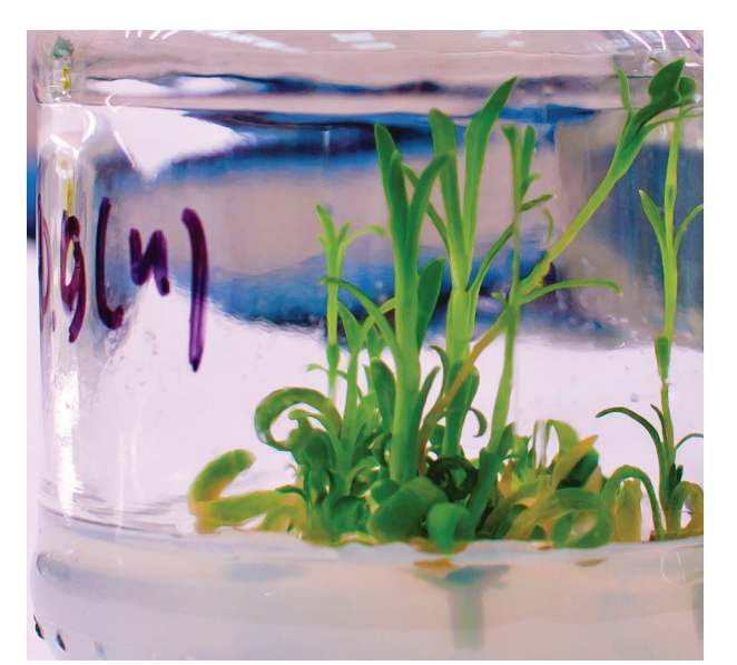
Fig. 4. Shoots elongation of Gypsophila uralensis on WPM medium with an IBA 0.5 mg / l + IAA 0.2 mg / l.

No visible morphological differences between intact plants and regenerants were noted. Genetic studies