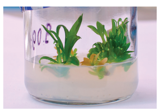
Fig. 3. Micropropagation Gypsophila uralensis on the SCS medium.

G. uralensis callus tissue cells are competent because they have a different morphogenetic response to the action of auxins and cytokinins. When auxins were introduced into the nutrient medium, roots were formed, and when cytokinins, gibberellins and auxins were added together, shoots were formed. The simultaneous differentiation of unrelated micro shoots and roots from fragment callus was noted.