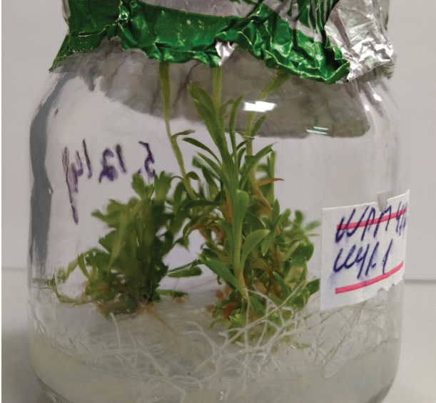
Fig. 5. Gypsophila uralensis regenerates, ready for planting in the ground (culture age is 45 days; medium WMP + IAA 1 mg / 1).

have not been conducted due to insufficient material.