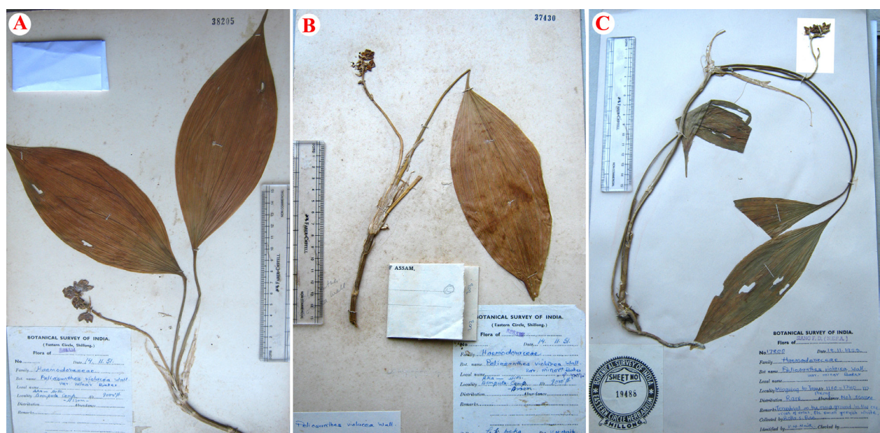
Fig. 1. Peliosanthes arunachalensis . A. Holotype (G. K. Deka s.n., ASSAM!, Acc. No. 38205). B. Isotype (G. K. Deka s.n., ASSAM!, Acc. No. 37430). C. Paratype (R. S. Rao 17800, ASSAM!, Acc. No. 19488).

Description. Stoloniferous, terrestrial herbs; stolons with internodes to 20–25 cm long, 0.5 cm in diam., covered with remnants of whitish scarios scales on nodes. Cataphylls lanceolate, 5–10 × 0.7–1.0 cm, papyraceous, later becoming partially disintegrated. Leaves 2, petiolate, suberect; petiole rigid, almost straight, terete, 13–20 cm long; leaf blade broadly elliptic, 16.5–21.5 × 5.5–8.5 cm, acuminate to shortly attenuate, entire along margins, glabrous, glossy; longitudinal veins many, prominent; secondary veinlets conspicuous, spaced, sub-perpendicular to main veins. Scape axillary, bearing 1–2 sterile bracts, stout, elongated, longer than raceme, 12–14 cm long, ca. 2 mm in diam.; sterile bracts 1.2–2.0 × 0.3–0.5 cm, acuminate, margins membranous. Raceme 2–3 cm long, 7–10-flowered; rachis longitudinally finely ridged. Floral bracts 2, scarios; bract located below flower, lanceolate, 0.8–1.0 cm long, 1.5–2.0 mm wide, distally acuminate to subulate, concave, equal or shorter than the flower;