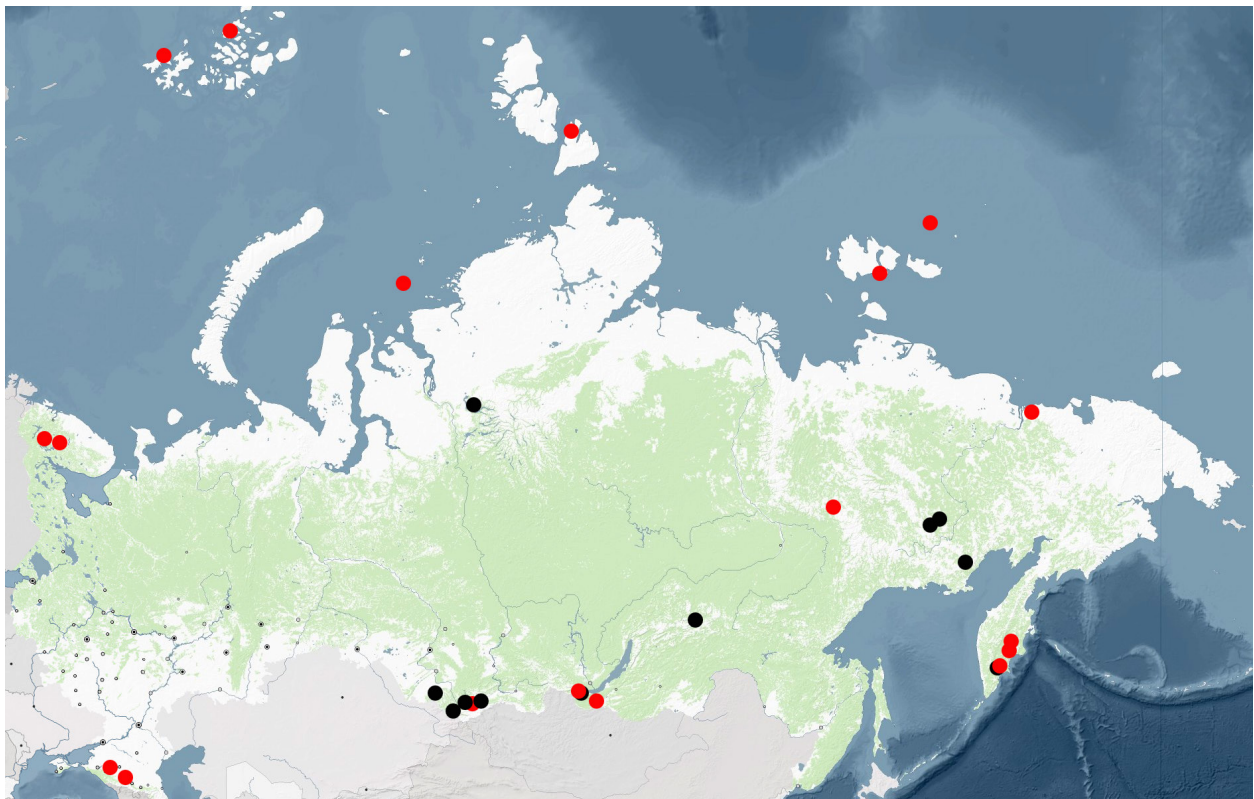
Fig. 3. The known distribution of Umbilicaria aprina (red) and U. rhizinata (black) in Russia based on the investigated specimens.

Distribution in Russia: Krasnoyarsk Territory (Putorana Plateau), Magadan Region (Kilganskies and Cherskogo ranges), Kamchatka Territory (Mishennaya Sopka Hill), Altai Mts (Altai Territory, republics of Altai and Tyva), Republic of Buryatia (Nam-Tzagan-Khutliyn-Nuruu Range), Trans-Baikal Territory (Kodar Ridge). (Fig. 3).