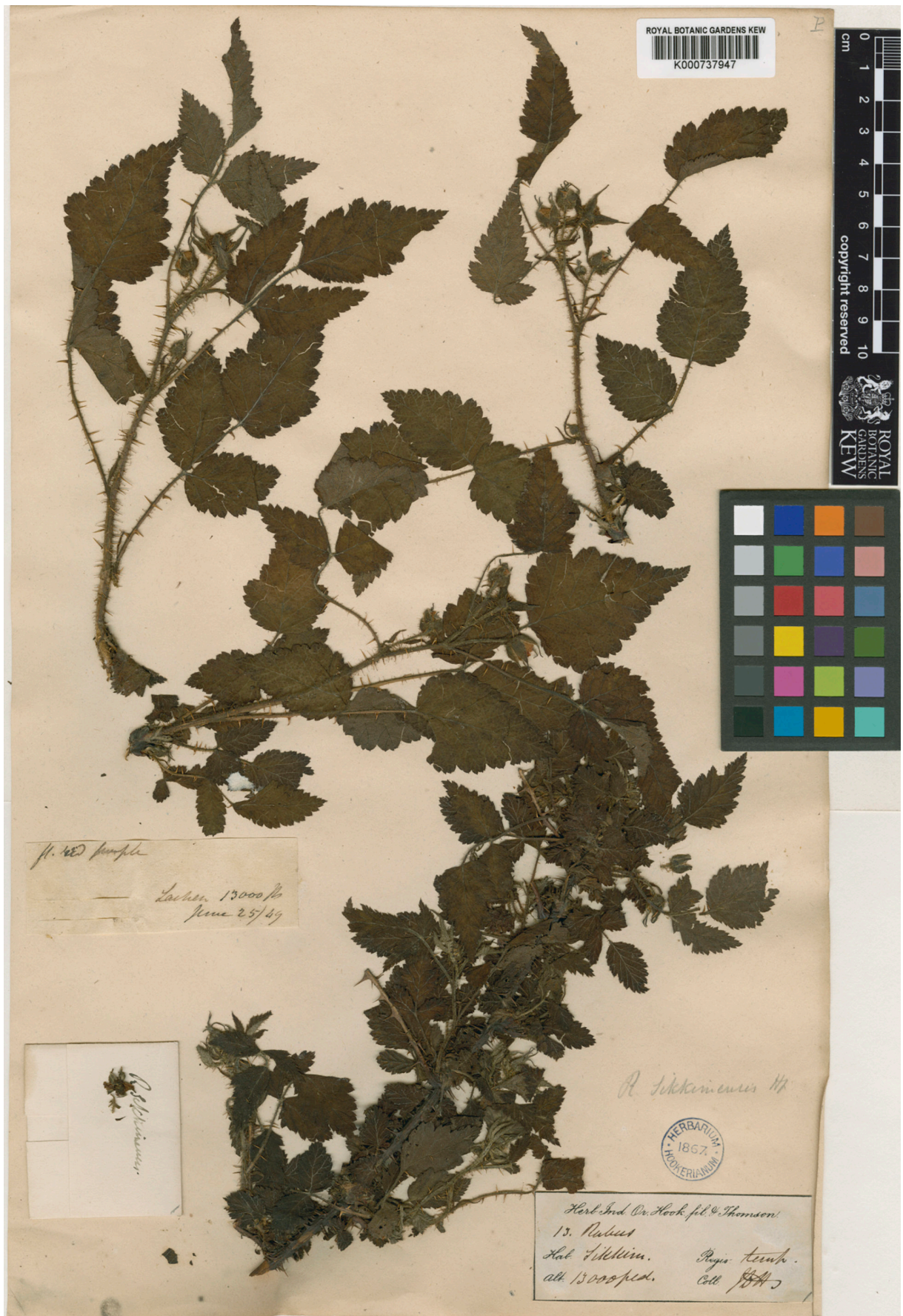
Fig. 2. Lectotype of Rubus sikkimensis Hook. f. (K000737947).