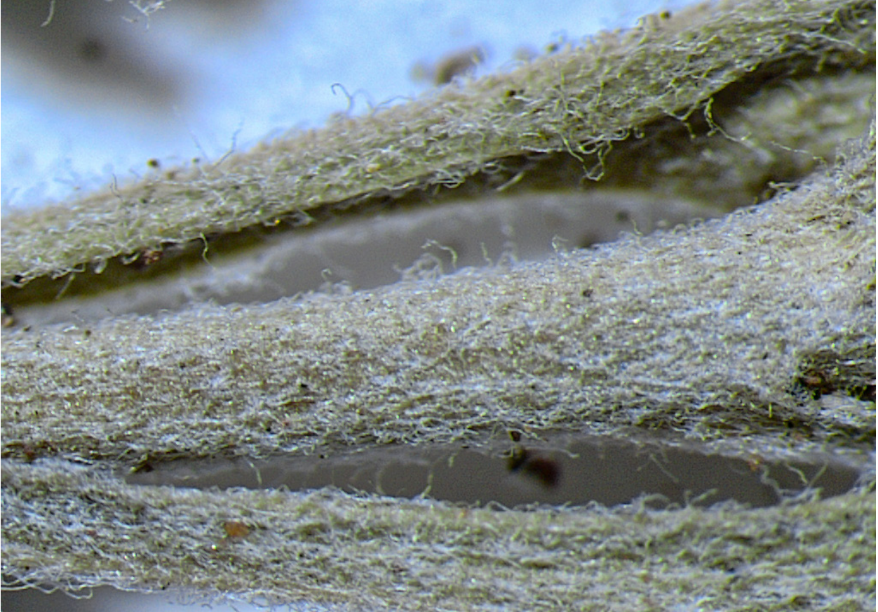
Fig. 4. Pubescence of the stem and leaf petioles with long sinuous hairs in the lower third of the stem.