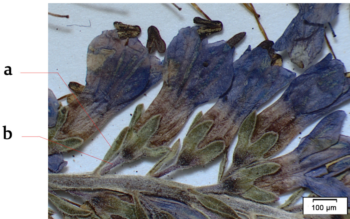
Fig. 6. Part of the inflorescence in the lower third: a – bract; b – peduncle.