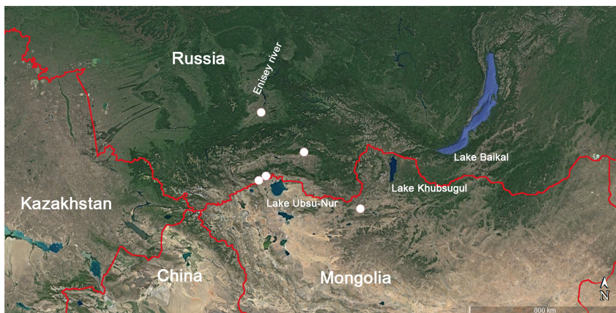
Fig. 1. Distribution of Veronica × albachii .