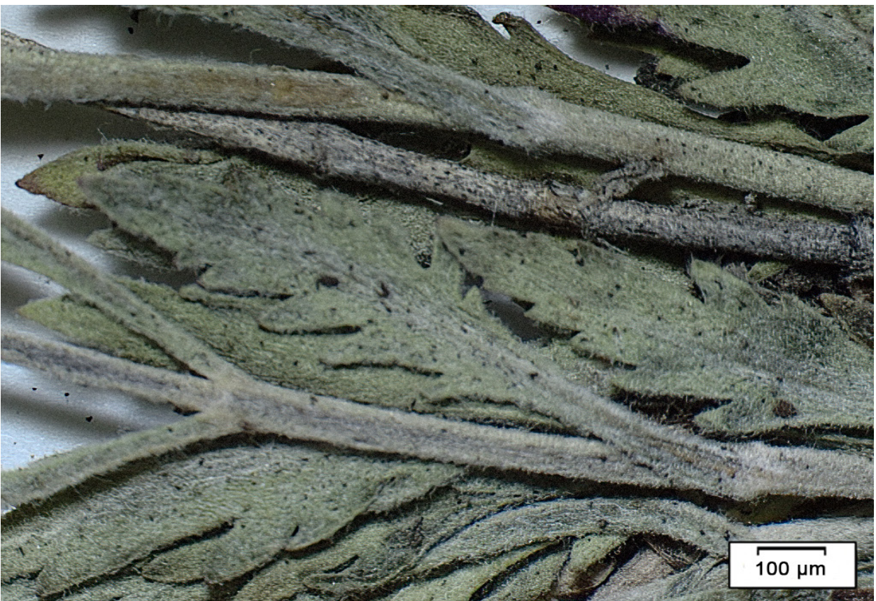
Fig. 5. Leaves in the middle part of the stem.