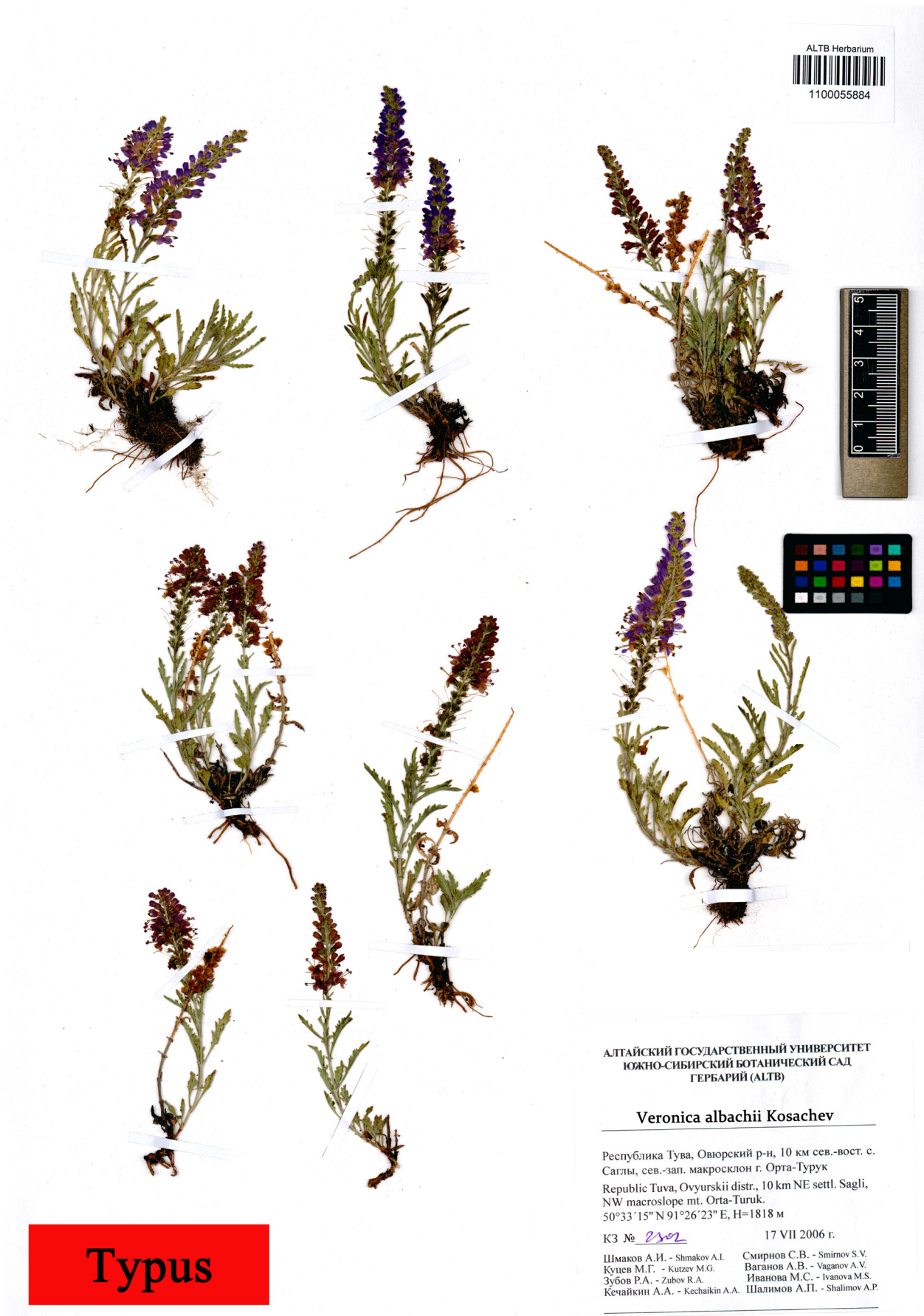
Fig. 2. Type of Veronica × albachii Kosachev.