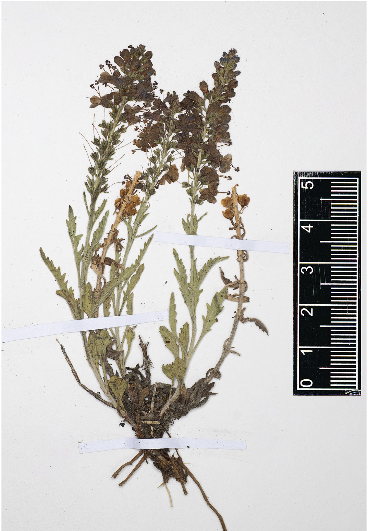
Fig. 3. General view of Veronica × albachii .