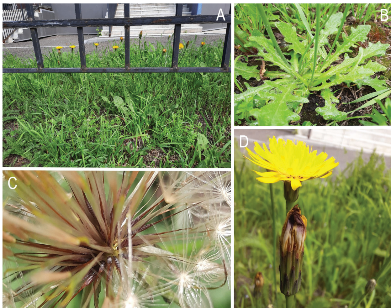
Fig. 1. Hypochaeris radicata , Tomsk: A – Habit; B – Basal rosette of leaves; C – Achenes with pappus; D – Capitula and involucre.

Hypochaeris radicata L.: "Russia. Tomsk Region, Tomsk, Kirovsky urban district. Lawns. 56°28'11.8"N, 84°57'03.0"E. 21 VI 2022. A. I. Pyak, E. A. Pyak / Россия, Томская область, г. Томск, Кировский район. Газоны, 56°28'11.8" с. ш. 84°57'03.0" в. д. 21 VI 2022. А. И. Пяк, Е. А. Пяк" (TK [TK004600]). – Within the natural European-South-West Asian range, this psammophilous edge-pine forest species occurs in regions with a temperate warm climate (Tzvelev, 2000; POWO, 2022). It is currently widely distributed in almost all continents in areas with a predominantly warm temperate climate. It occurs as a weed along roadsides, in the outskirts of fields and mainly on lawns. The ubiquitous wide distribution of the lawns in populated areas contributes to the further active spread and to its inclusion in the list of invasive species in many countries (Ortiz et