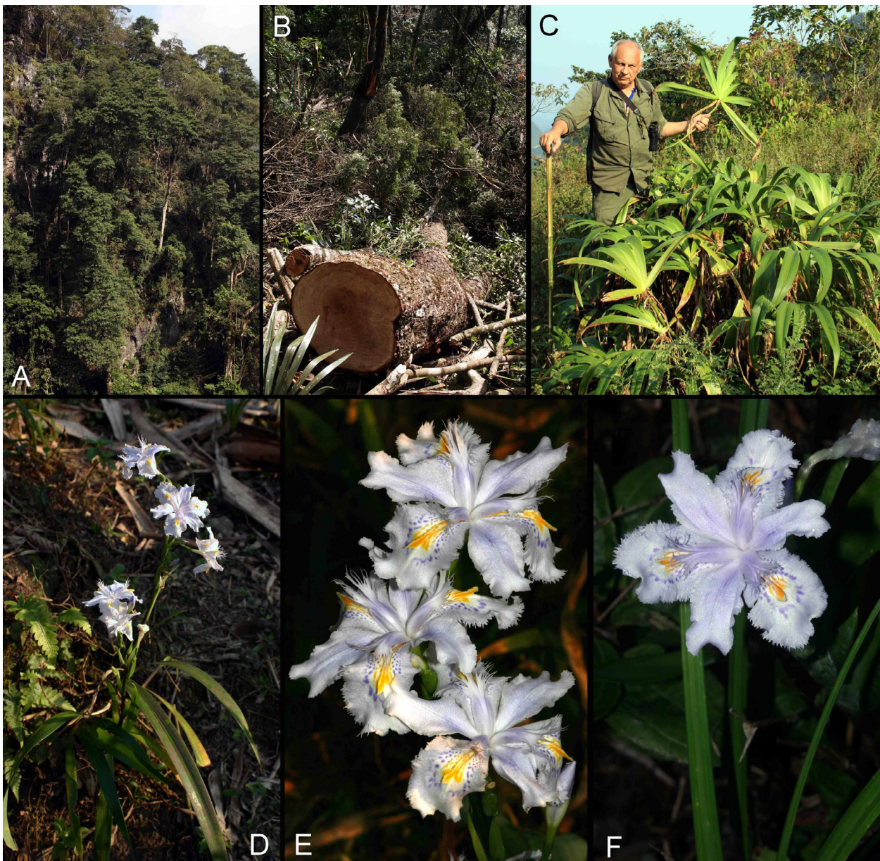
Fig. 2. A, B – Typical habitat of Iris japonica and I. tectorum in northern Vietnam (Cao Bang province, primary limestone forest, 1500–1550 m a.s.l. CPC 7532). C-F – I. japonica in natural habitats (C – CPC 5366a; D, E – HAL 6622; F – CPC 7532 ass.).

Habitat, phenology and conservation status. Terrestrial or lithophytic herb or undershrub to 1.5(2) m tall. Open primary and secondary evergreen forest margins, open secondary scrub, wet secondary grasslands on rocky mountain slopes on soils derived from any kind of rocks, commonly among rock outcrops. (500)800–2000 m a.s.l. Flowers in any time of the year with maximum in March – May.