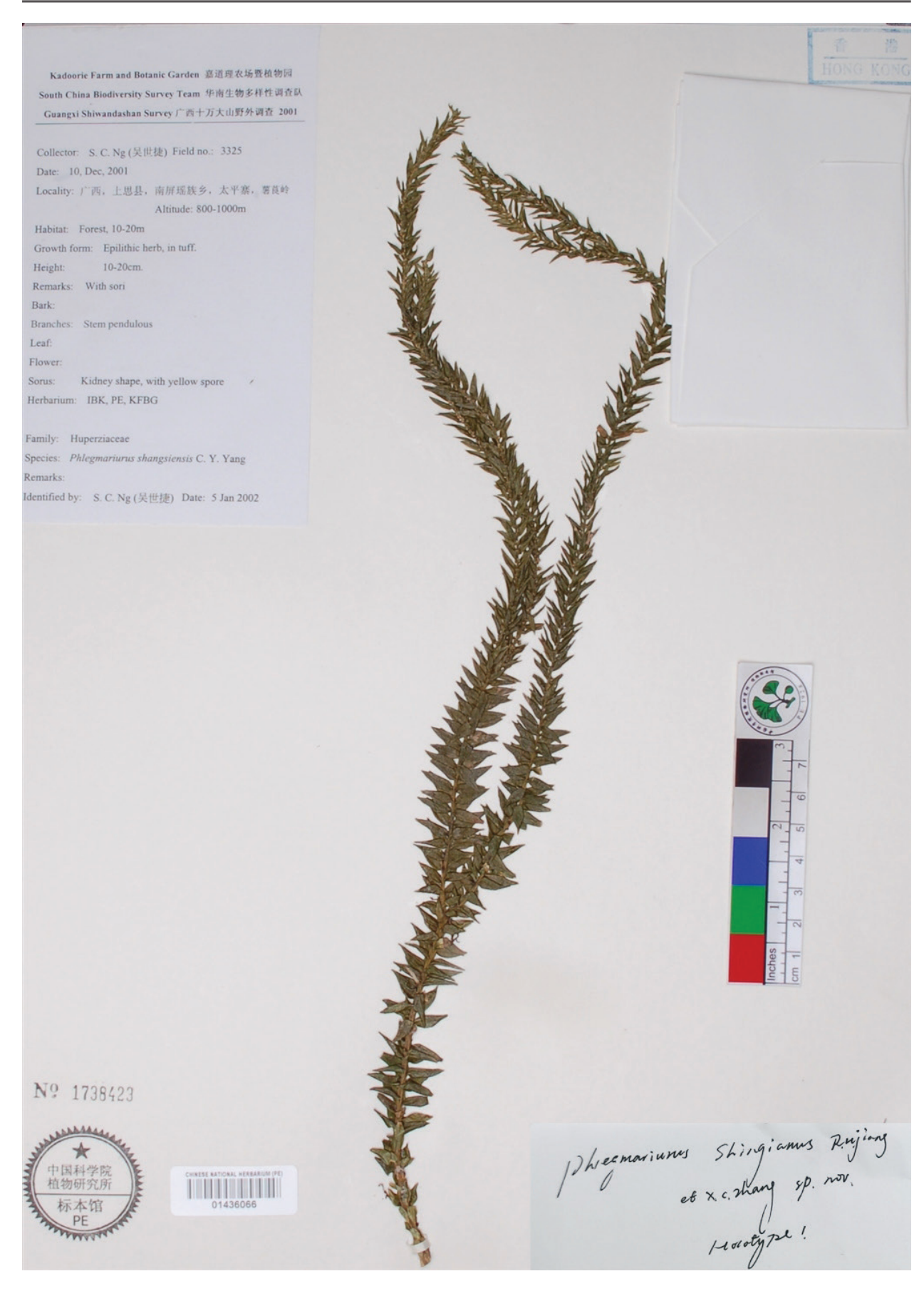
Fig. 2. Holotype of Phlegmariurus shingianus R.-H. Jiang et X.-C. Zhang (S. C. Ng 3325, PE).