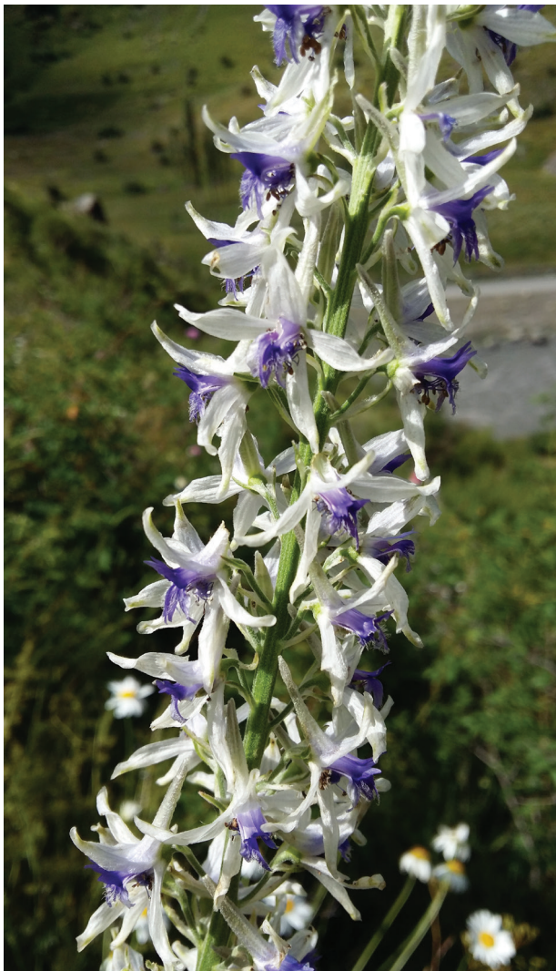
Fig. 2. The inflorescence of Delphinium samurense .

Holotype: “Dagestan, Rutulsky district, above the village of Djinykh, 1790 m. 41°67'49.1"N, 47°04'02.2"E. 26 VII 2016. R. Murtazaliev” (LE, fig. 5; iso – LE, DAG, МНА). Голотип: «Дагестан, Рутульский р-н, выше с.[ела] Джиных, 1790 м.