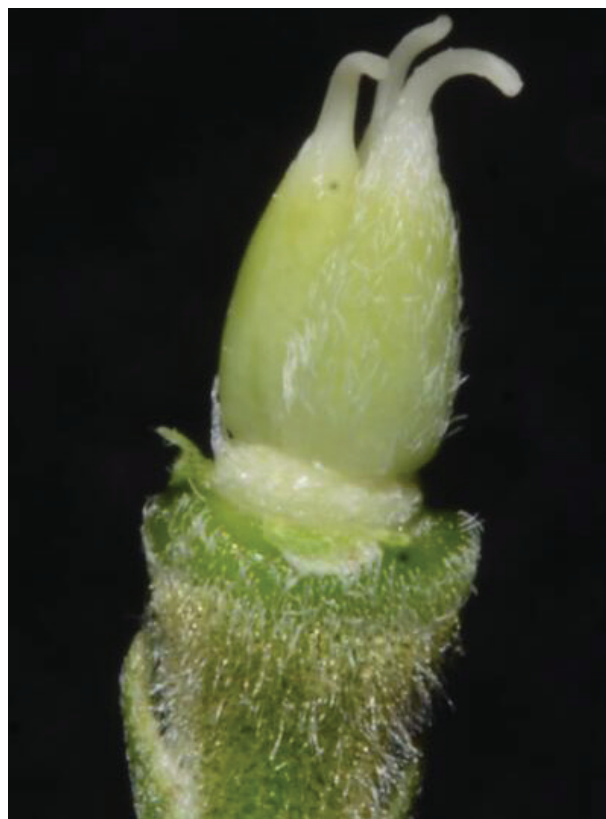
Fig. 4. The carpels of Delphinium samurense .

L., Anthriscus nemorosa (M. Bieb.) Spreng., etc.; shrubs such as Rosa pimpinellifolia L., Berberis vulgaris L., Spiraea hypericifolia L., Cotoneaster sp.