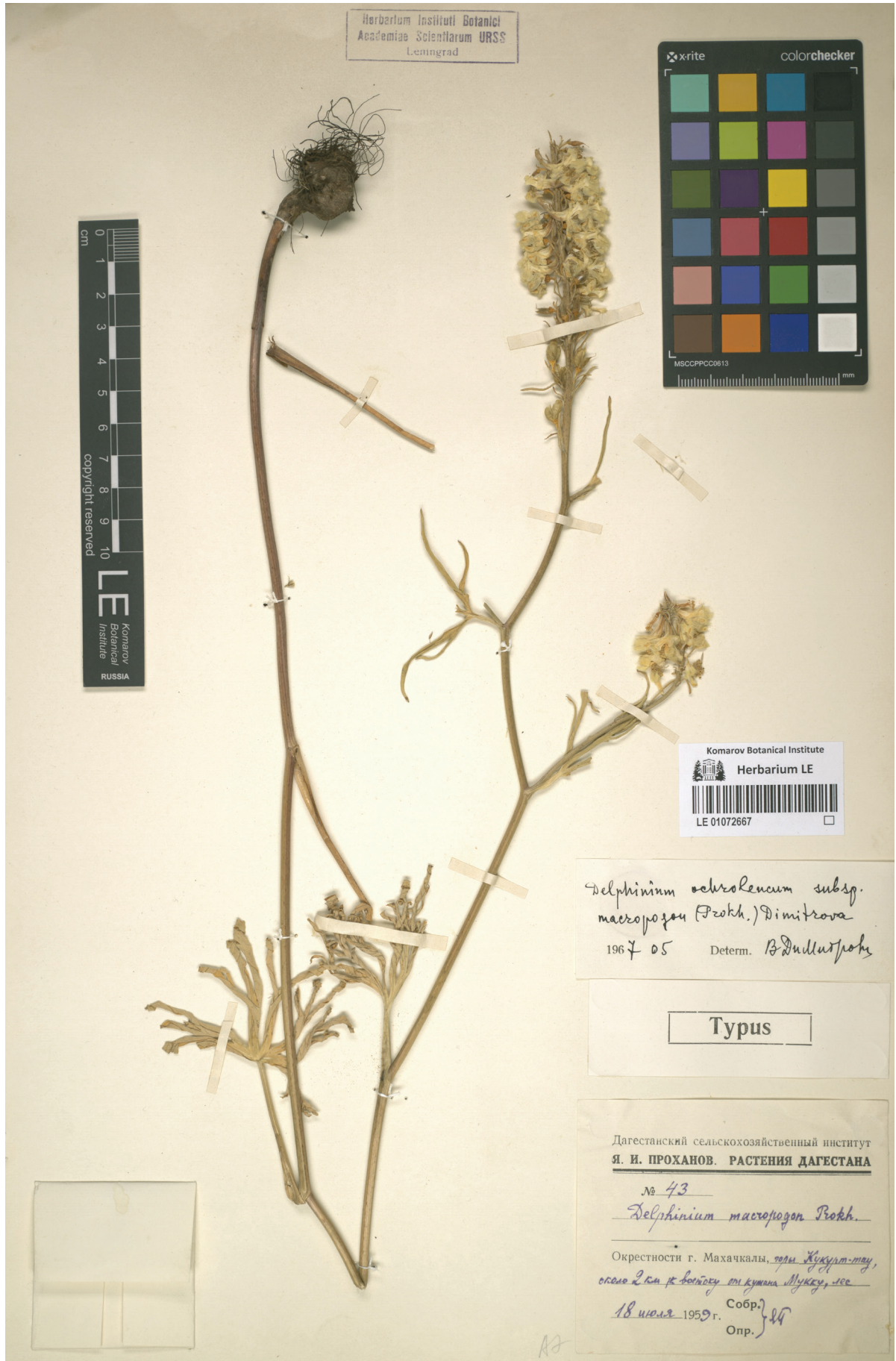
Fig. 6. The holotype of Delphinium macrogon Prokh. (LE).