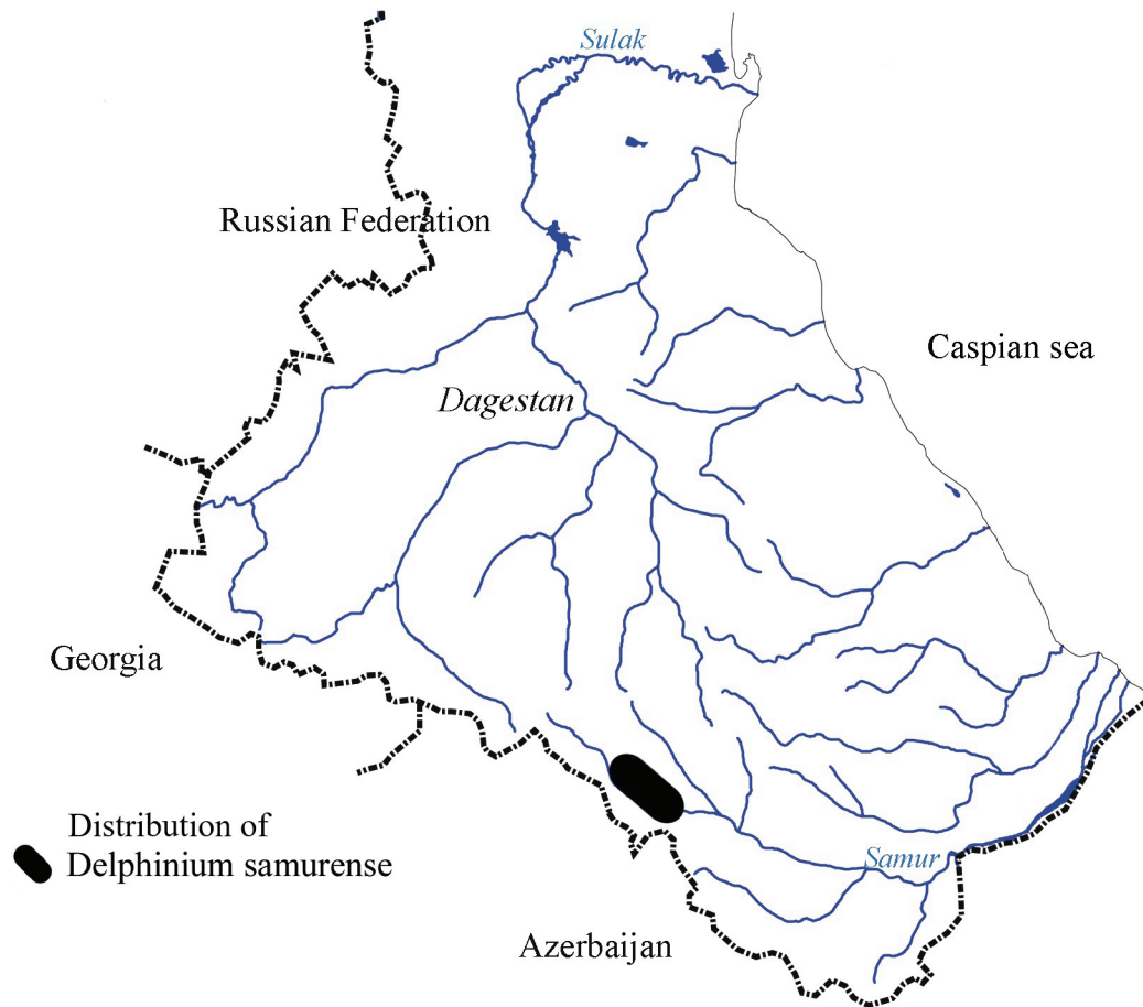
Fig. 7. The distribution map of Delphinium samurense .

A closely related species D. macropogon occurs in vicinities of Makhachkala: Talgi gorge, Tarki-Tau (Prokhanov, 1961; Murtazaliev, 2009, 2016; Anatov, 2020). The type of the species range is northern Dagestan.