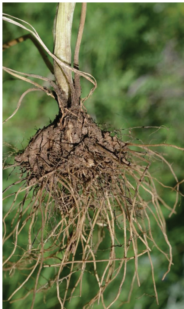
Fig. 1. The underground part of Delphinium samurense .

row, compact (Fig. 2). Bracts entire, narrowly lanceolate, 8\text{--}15 \times 0.8\text{--}3 mm, 1.5–2 times longer than the pedicels or equal to them. At the base of the inflorescence, the bracts twice or thrice trifid, 4\text{--}7 \times 3\text{--}6 cm, 2–3 times longer than the pedicels. Two bracteoles attached close to each other, located 1–3 mm from the calyx, linear-subulate, entire, usually arcuate, 3\text{--}6 \times 0.5\text{--}1.5(2) mm. Calyx white, often with yellowish and light green stripes on the bottom, after drying often (not always) turning blue, covered from the outside with simple, very short (0.2–0.4 mm long), appressed, arcuate and straight hairs. Spur straight or slightly arcuate, 14–17 mm long, 2–2.5(3) mm thick. (fig. 3a), 2–3 times longer than the pedicels. Lateral sepals 10\text{--}14 \times 4\text{--}7 mm, broadly cuneate at the base, acute or rounded at the tip (fig. 3b). Lower sepals 10\text{--}14 \times 2\text{--}4 mm, narrowly cuneate at the base, pointed at the top (fig. 3c). Corolla blue, with blue, less often purple, longitudinally arranged veins. Petal nectaries 10\text{--}13 \times 1.5\text{--}2 mm, narrow, pointed at the base and broadened to the bifid top with narrow acute lobes